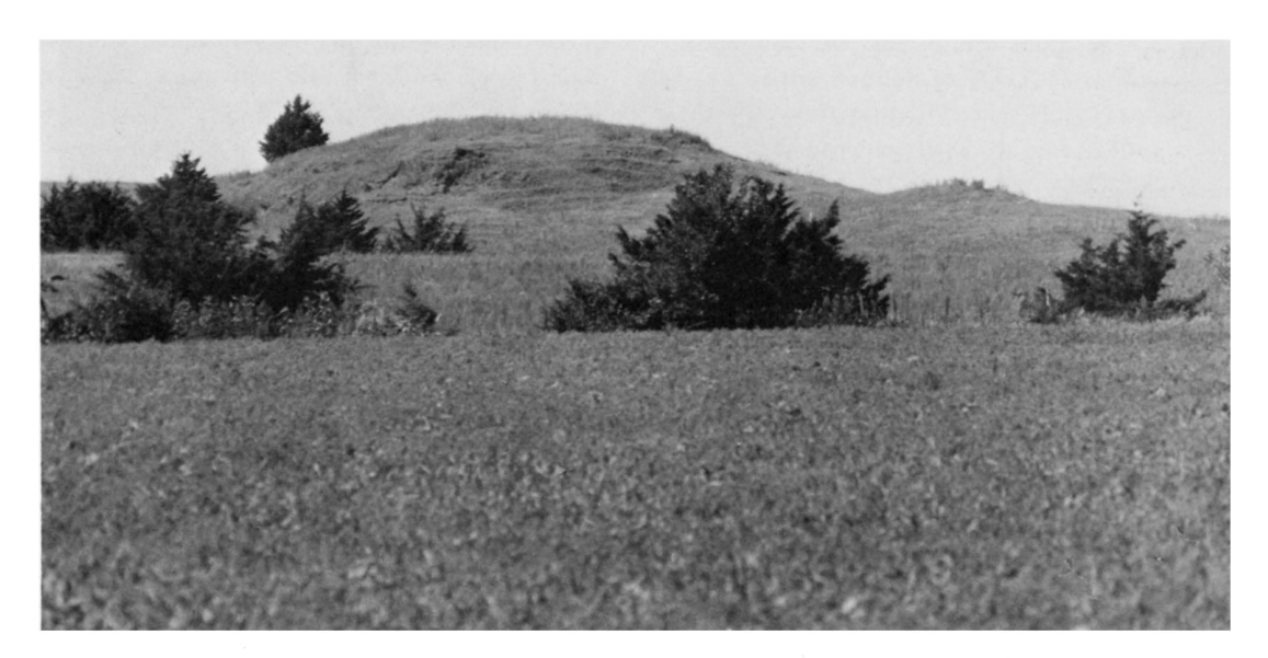
FIG. 9. Curaspa:ku, Girl Hill, on the right bank of the Platte River near Central City, Nebraska. Identification is tentative.