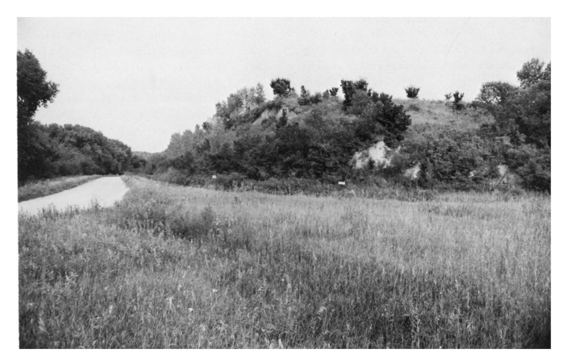
FIG. 8. Hill That Points the Way, August 1982.