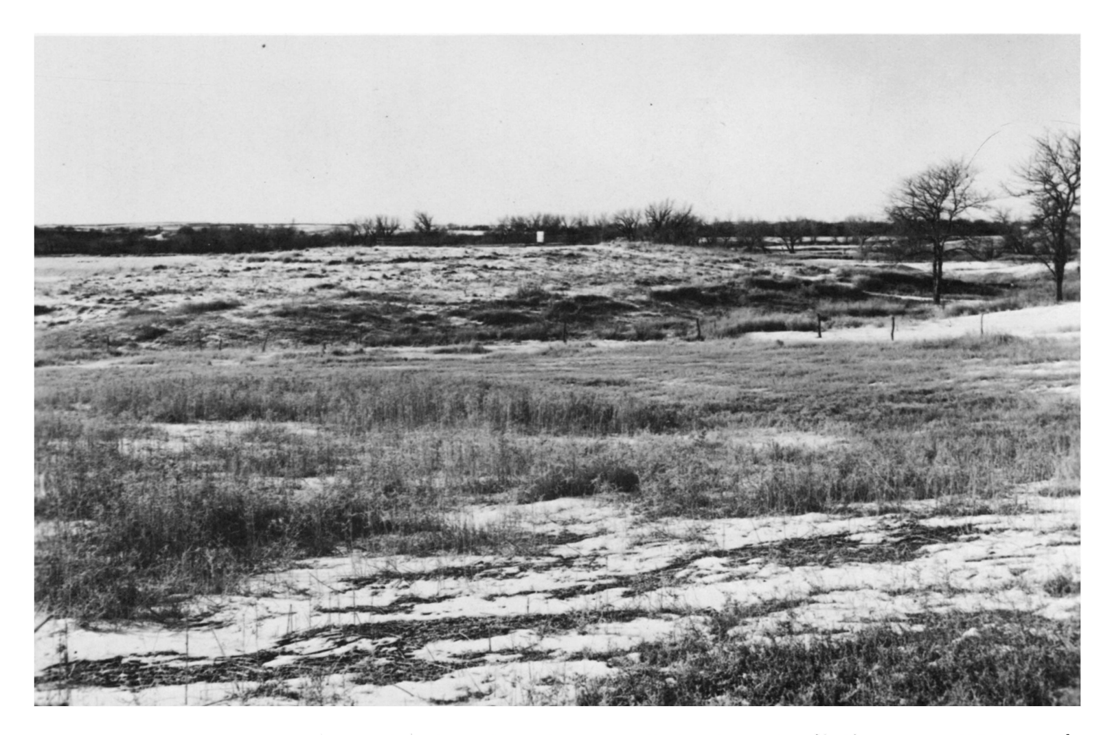
FIG. 5. Ground view of Waconda Spring from the southwest, showing broadly domed mound profile.