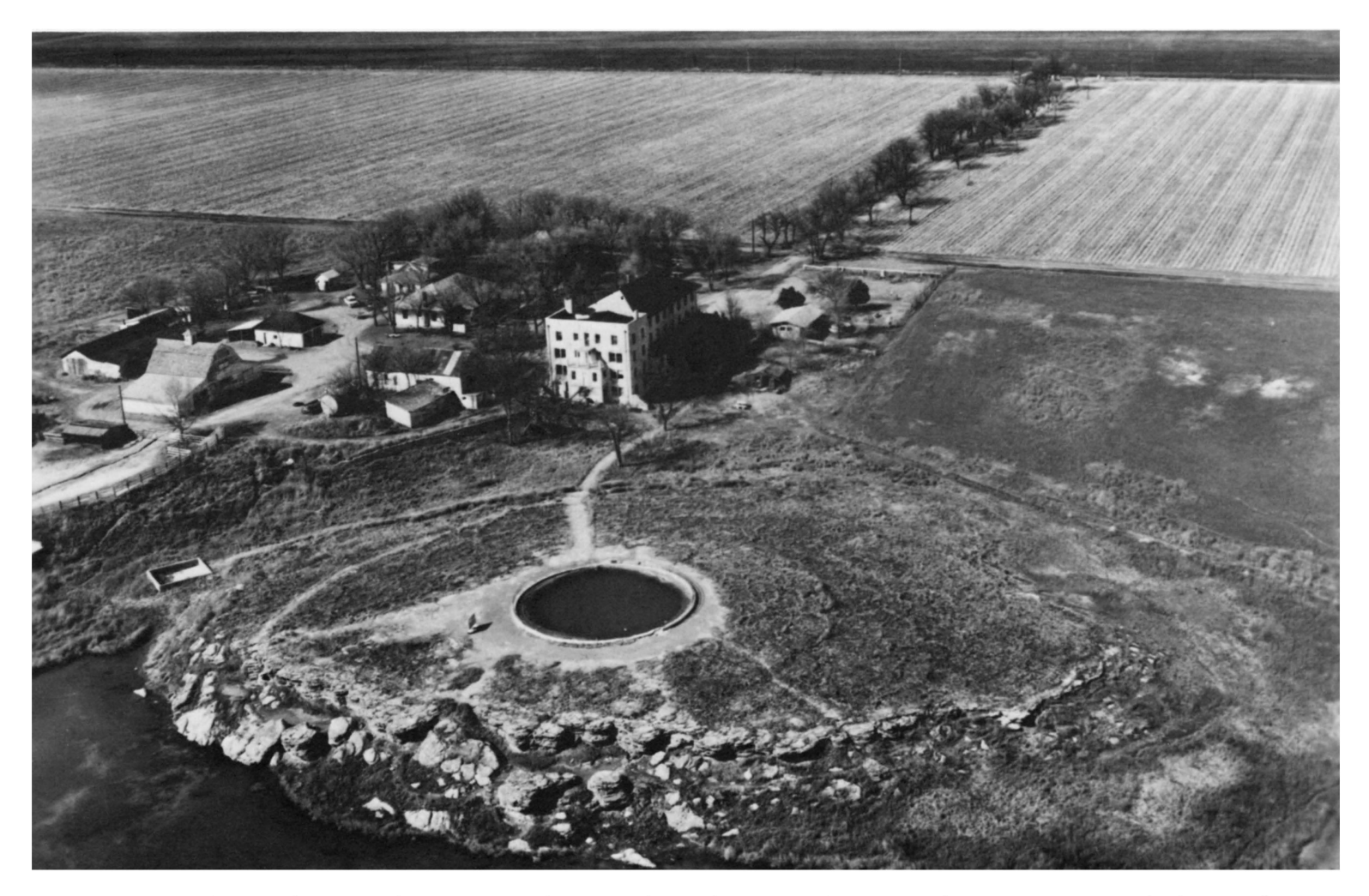
FIG. 4. Aerial view of Kicawi:caku, Spring on the Edge of a Bank or Waconda Spring and sanitarium in 1965, looking northwest.