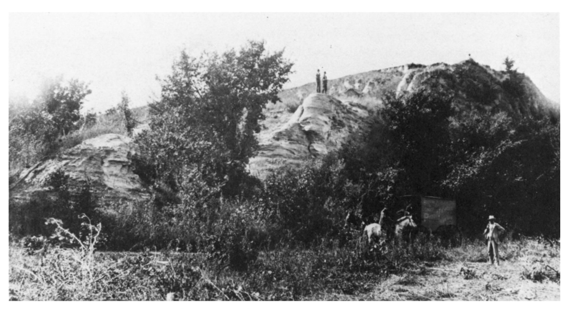
FIG. 7. Pa:ku:ru', Hill That Points the Way, opposite Guide Rock, Nebraska, on the south side of the Republican River, October 1904.