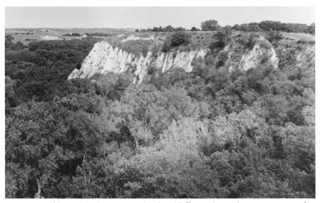
FIG. 6. Ahkawita: ka, White River Bank, a loess bluff on Cedar Creek near its junction with the Loup River. Identification is tentative. Photo by Waldo R. Wedel, August 1982.

Pa:hu:ru' (Hill That Points the Way). Only Grinnell mentions this site as one at which there was an animal lodge. The site is mentioned in the Skiri story that also mentions Dark Island. Hill That Points the Way was the last of the four lodges visited by the young man before he returned to Mound on the Water. No characterization of the site is given in the story, but Grinnell does identify it as Guide Rock, a wellknown landmark near the present town of Guide Rock near the Kansas border in south central Nebraska.