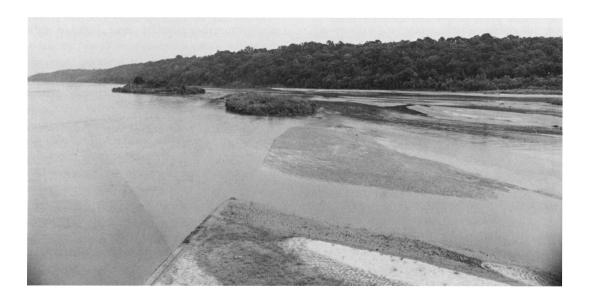
FIG. 3. Pa:haku on the south bank of Platte River about six miles west of Fremont, Nebraska. View is southwest from the abandoned Chicago and Northwestern bridge. Photo by Waldo R. Wedel, August 1982.

On the basis of Gilmore's description, we