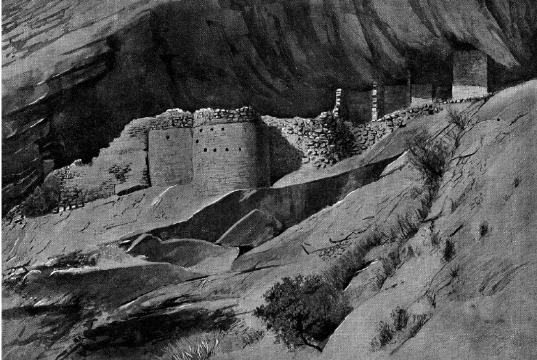
Figure 2: Monarch Cave Ruin, as drawn by a member of Warren K. Moorehead's expedition in 1892

indicating a probability that, had they been left in undisturbed possession of the continent, they would have succeeded in advancing their condition out of the prehistoric state. The evidence afforded by their works of every kind—their architecture, their sculpture, their writing [ sic ], their minor arts, their traditions—seem all against the supposition that they had latent energy sufficient for progress to civilization. (Frothingham 1888:260–261)