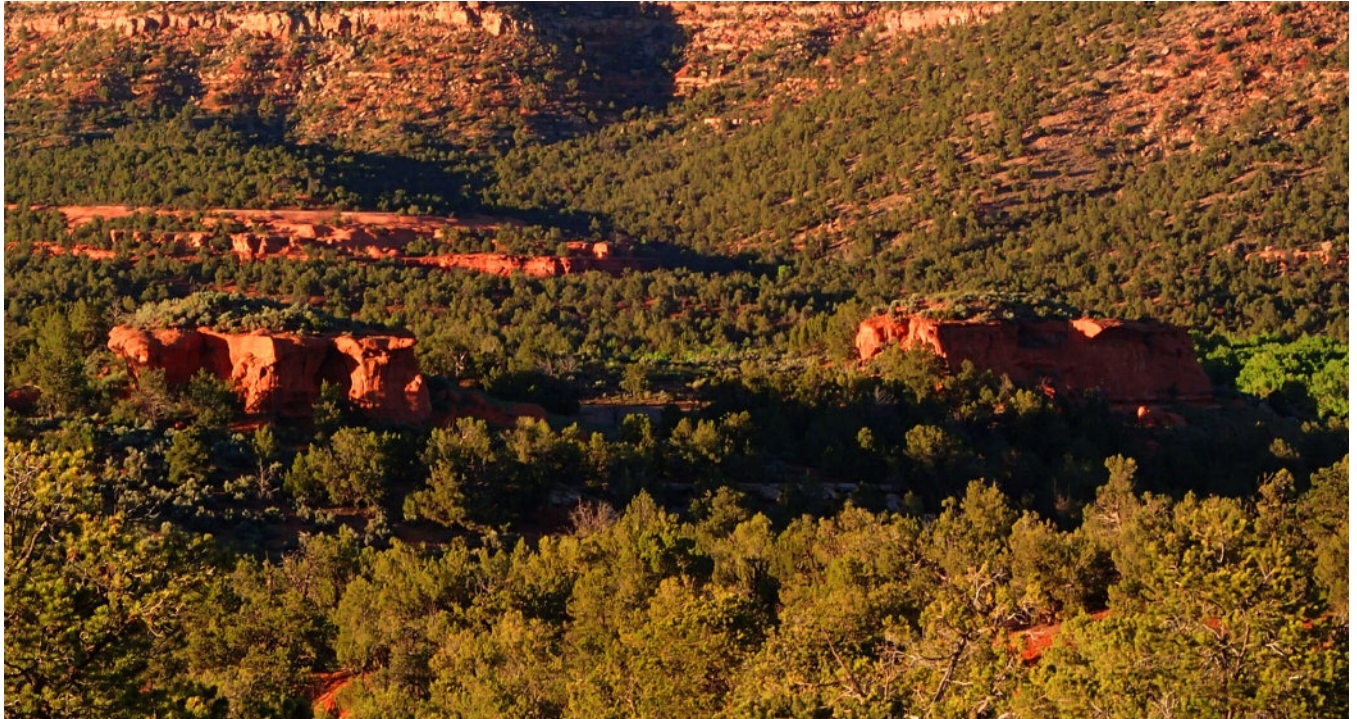
Figure 5: The Red Knobs site, one of several major population centers in the Bears Ears area built near twin-rock formations

The Pueblo II period in the Four Corners is one of major demographic shifts. Around AD 890, a climatic change to cooler, drier conditions seems to have caused a shift in settlement patterns, and by the beginning of Pueblo II many people had moved out of the San Juan Drainage as a whole. During the AD 1000s, the climate shifted again to prevalently hospitable conditions, with predictable growing seasons and reliable precipitation. Owing at least partly to this, the Pueblo II period saw the emergence of the “great house” system of community organization, best known and expressed in the Chaco Canyon area of northern New Mexico. The climatic plenitude of the mid-Pueblo II period accompanied a significant population surge in the Bears Ears area suggestive of immigration, “in this case possibly including the return of families who had moved south to Chaco and other regions during the [AD] 900s” (Hurst and Robinson 2014:34). This is supported by two lines of evidence. First, reoccupation of earlier Basketmaker sites by people associated with the Pueblo II period are common, especially on Cedar Mesa, suggesting reoccupation of the area by people who already knew it. Second, Chacoan influence is recognized throughout the Bears Ears area dating to or after the mid-Pueblo II period (e.g., Till 2017).