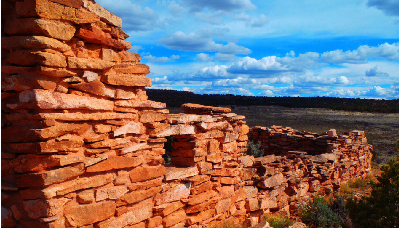
Figure 6: One of the most iconic structures located in the appropriately named Ruin Park

researchers to be socially symbolic rather than utilitarian in nature (Van Dyke and King 2010).