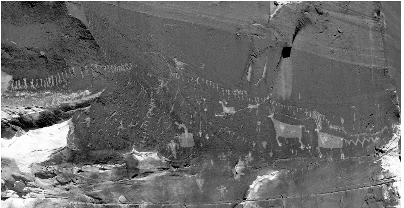
Figure 4: The Procession Panel, a petroglyph site evidently depicting the mobile nature of the Basketmaker III period in the Bears Ears area

Lower-elevation Pueblo I settlements also occur on Alkali Ridge and the Dolores areas to the east, as well as Bluff and Comb Wash, suggesting a “go high, go low” strategy where some people moved into lower drainages looking for water while the rest account for the higher-uplands boom mentioned above (William D. Lipe 2017, personal communication). Interestingly, there is also a marked correlation with subsequent major population centers and twin-rock formations in the Bears Ears area (e.g., Figure 5), possibly suggesting some form of cultural remembrance for the time everyone gravitated to the Bears Ears themselves when the weather turned frightful (Burrillo 2017:131–132).