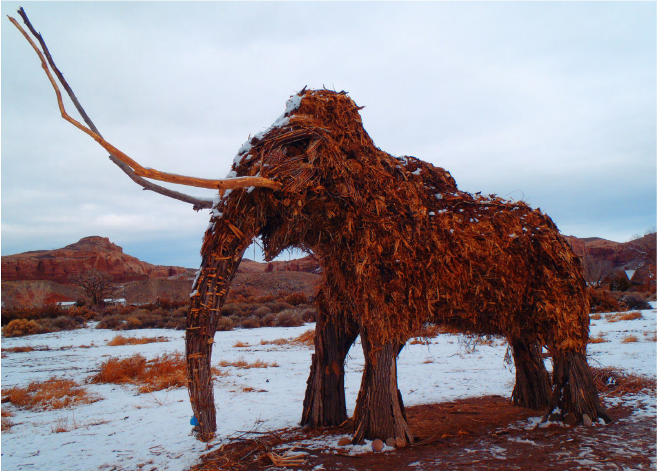
Figure 3: Mammoth statue built and burned on the winter solstice in Bluff, Utah, in remembrance of the mammoth petroglyph controversy

The Formative era in the Southwest is typically subdivided into Basketmaker II (1500 BC to AD 500), Basketmaker III (AD 500–750), Pueblo I (AD 750–900), Pueblo II (AD 900–1100), Pueblo III (AD 1100–1300), and Pueblo IV or Modern Pueblo thereafter. It is during these time periods when the aforementioned “mosaic” nature of human–environment interaction comes into clearest view in the culture history of Bears Ears.