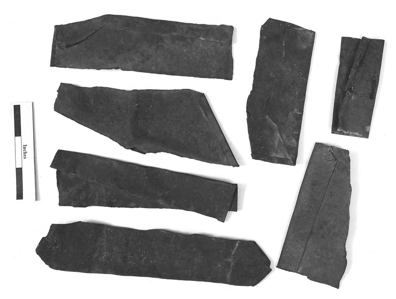
Figure 3. Possible tin can tools, House 13.

The possible can tools were examined by Eugene Hattori (personal communication 2002), who observed use wear on one of the elongate specimens (PH2-024) and pointed out that projections occur on several of the edges. He suggested that this type of tool would have been suitable for splitting willows. He also observed that the triangles had been manufactured by cutting a strip of can with shears, as evidenced by the fact that they were swept down on one side. The pieces were turned as they were cut. Hattori suggested that the triangles might also be blanks for another type of artifact.