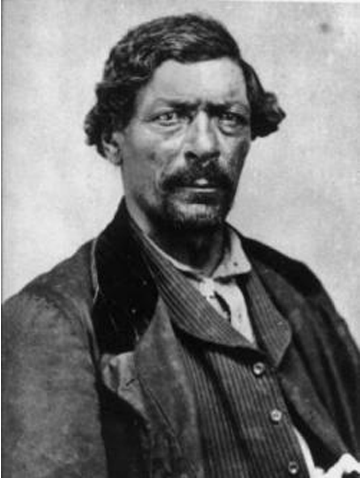
Figure 1: Jim Beckwourth.