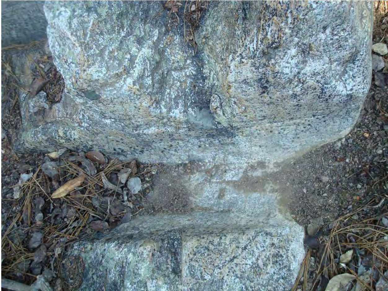
Figure 7. Wagon ruts in soapstone. Segment 9.

Segment 10 runs west to east on the north side of the Oro-Quincy Highway just past Frog Rock, across the highway from the north side of Segment 9. Soapstone boulders border the trail along the berms for most of the segment. The trail is 418 ft. long, has a bottom width of 8 ft., and has a depth of 1 ft. 5 in. The western edge was destroyed by the construction of the Oro-Quincy Highway. The eastern edge disappears into a field of whitethorn, and logging activity most likely disturbed the soil. This segment was classified as Category 1. Associated artifacts consist of one non-diagnostic metal plate and one metal clip or binder loop.