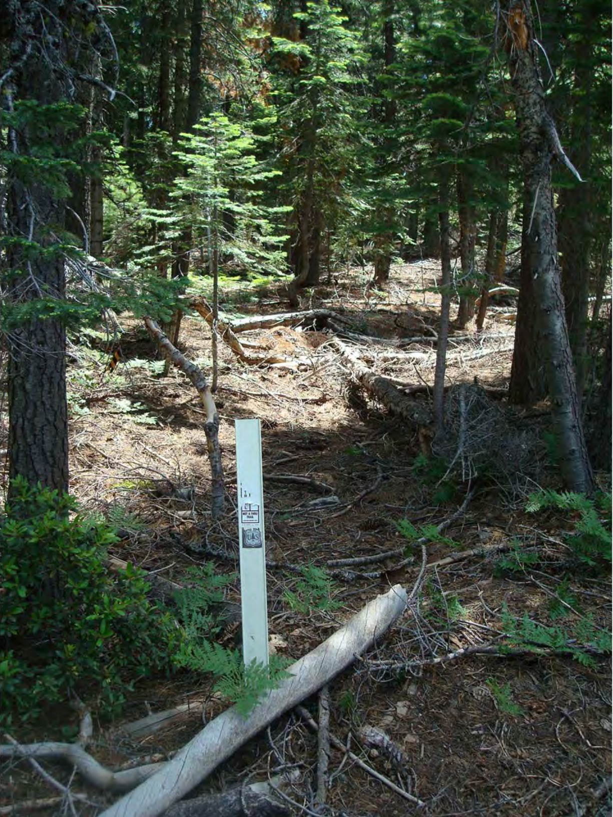
Figure 4: Category 2 -- Segment 13.