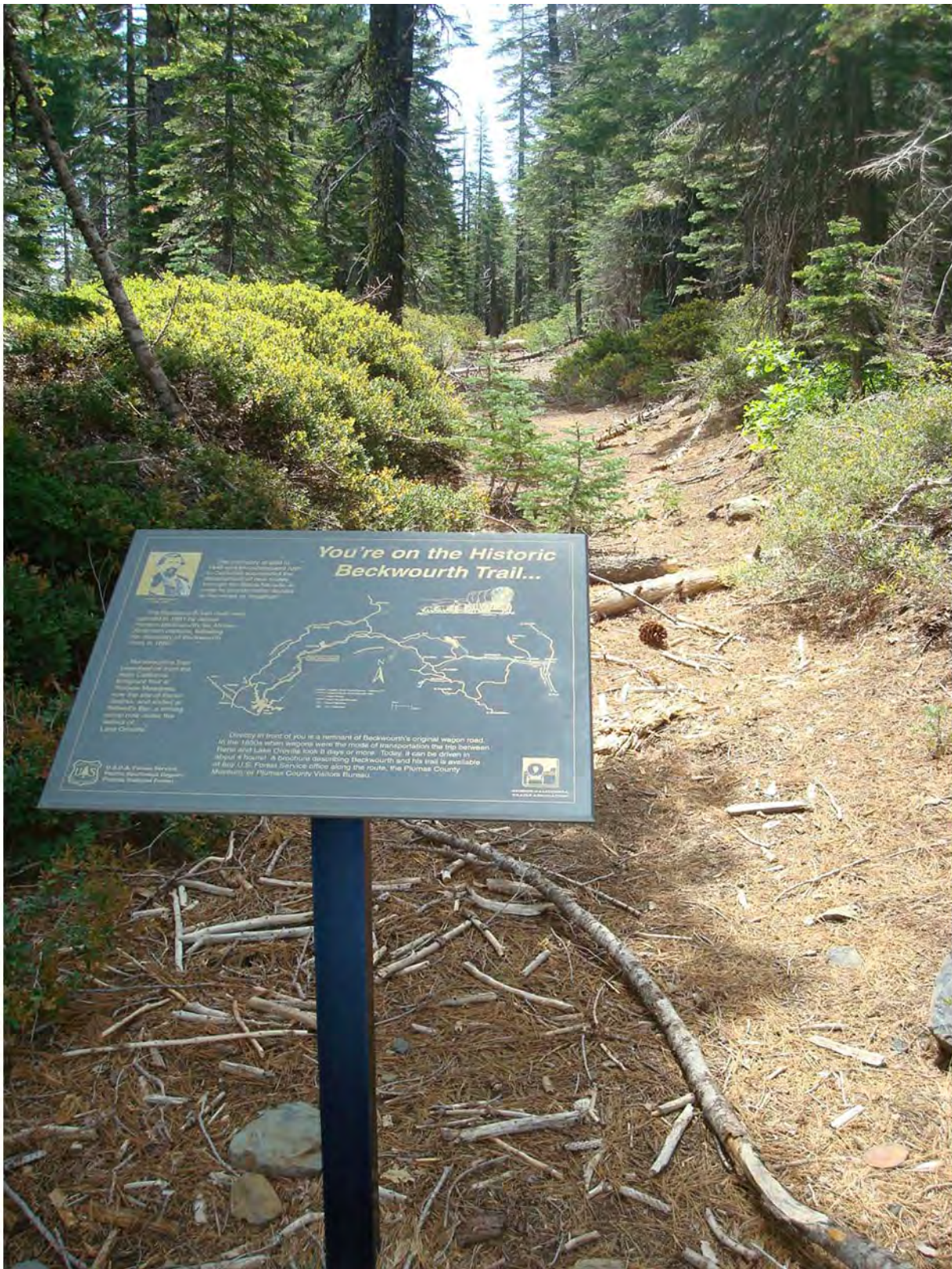
Figure 3: Category 1 -- Segment 6.