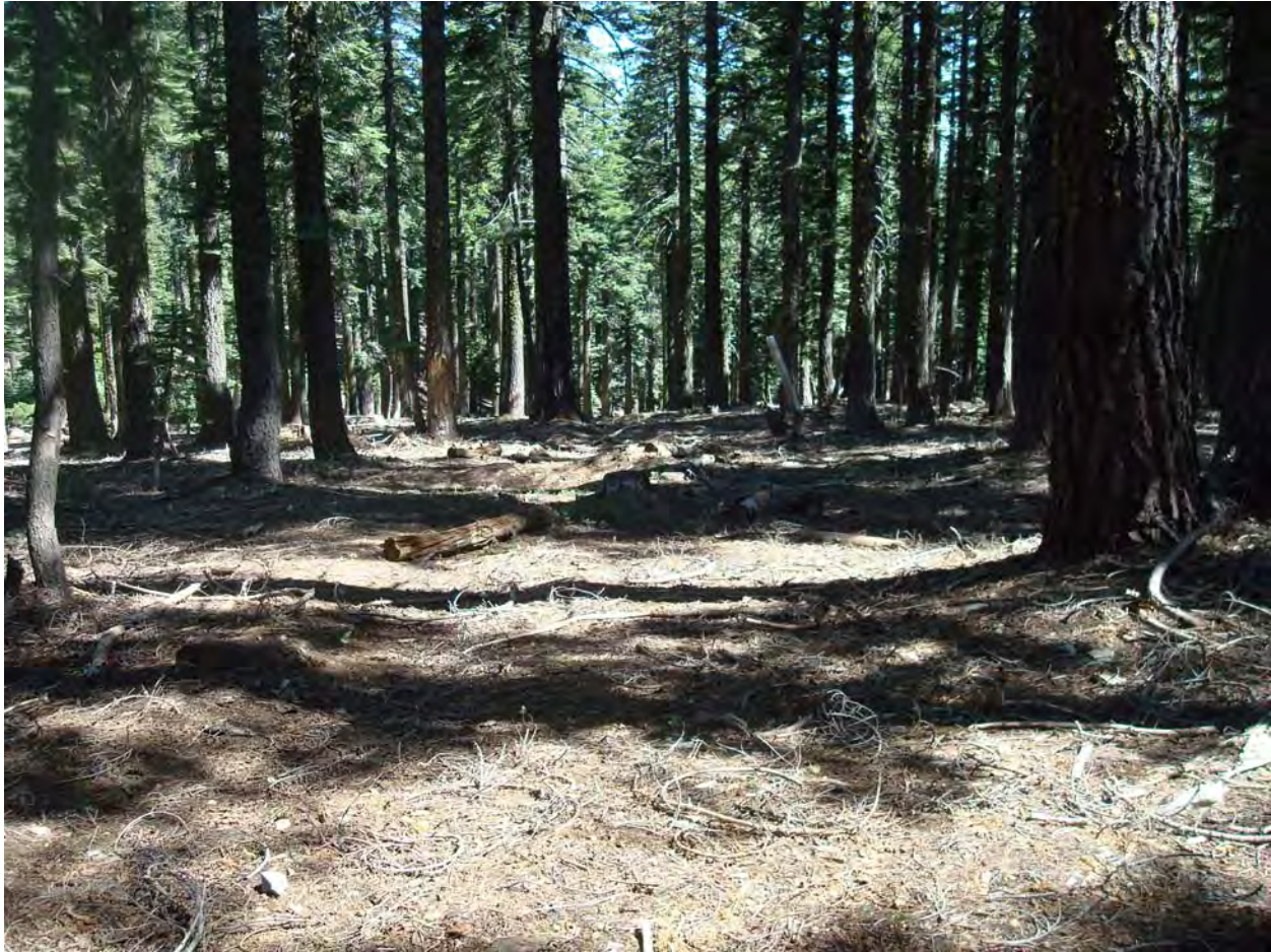
Figure 5: Category 3 -- Segment 17.