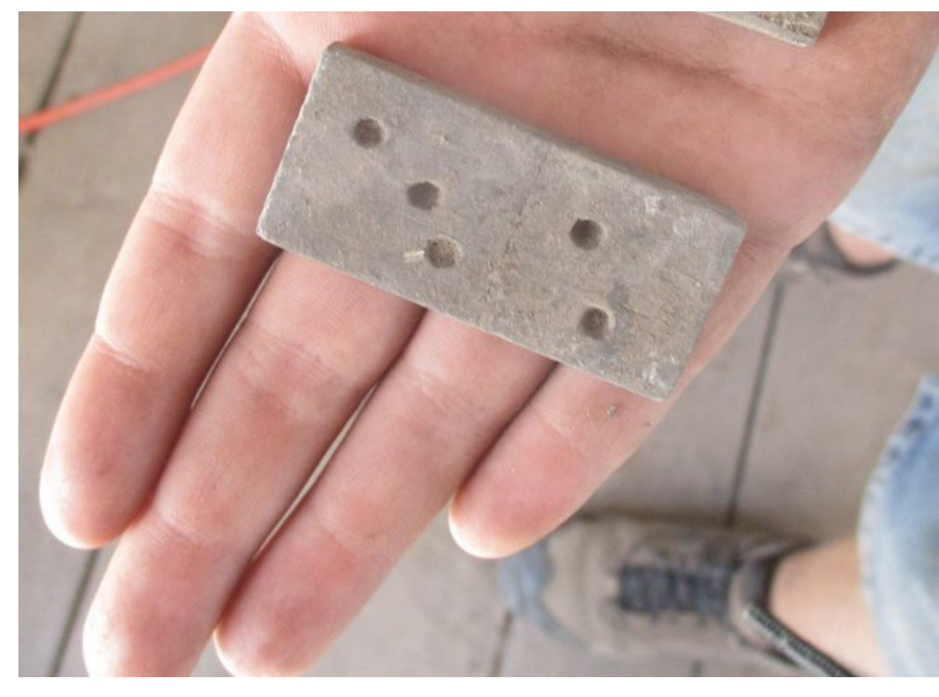
Wood domino found under the floor at the Last Chance Store.

time the property was used as a mercantile along the Santa Fe Trail. Principal investigator, Bob Blasing, led approximately 135 participants during the twoweek program as they worked through a variety of components and classes. Excavation units were dug at locations on the property where previous remote sensing tests indicated possible underground features, but also included limited areas inside the Last Chance Store