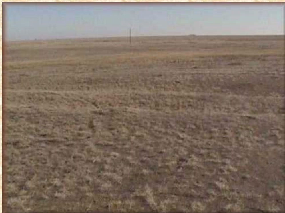
Township 22 South of Range 17 West, Pawnee County, Kansas