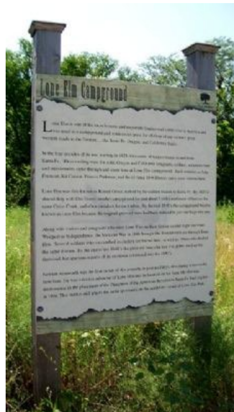
August 12, 2010