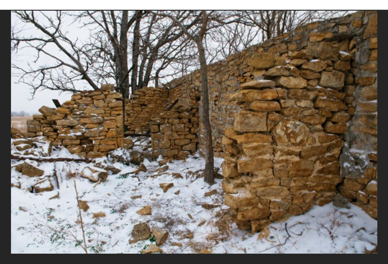
The ruins of the Havana stage station and hotel