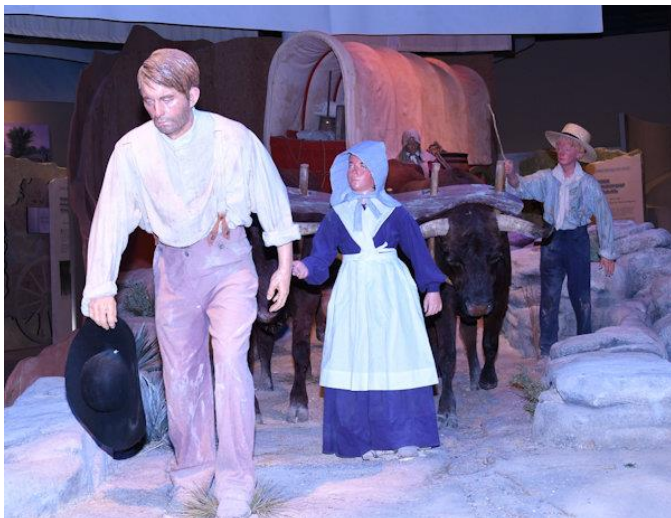
One of the many impressive exhibits at NHTIC.