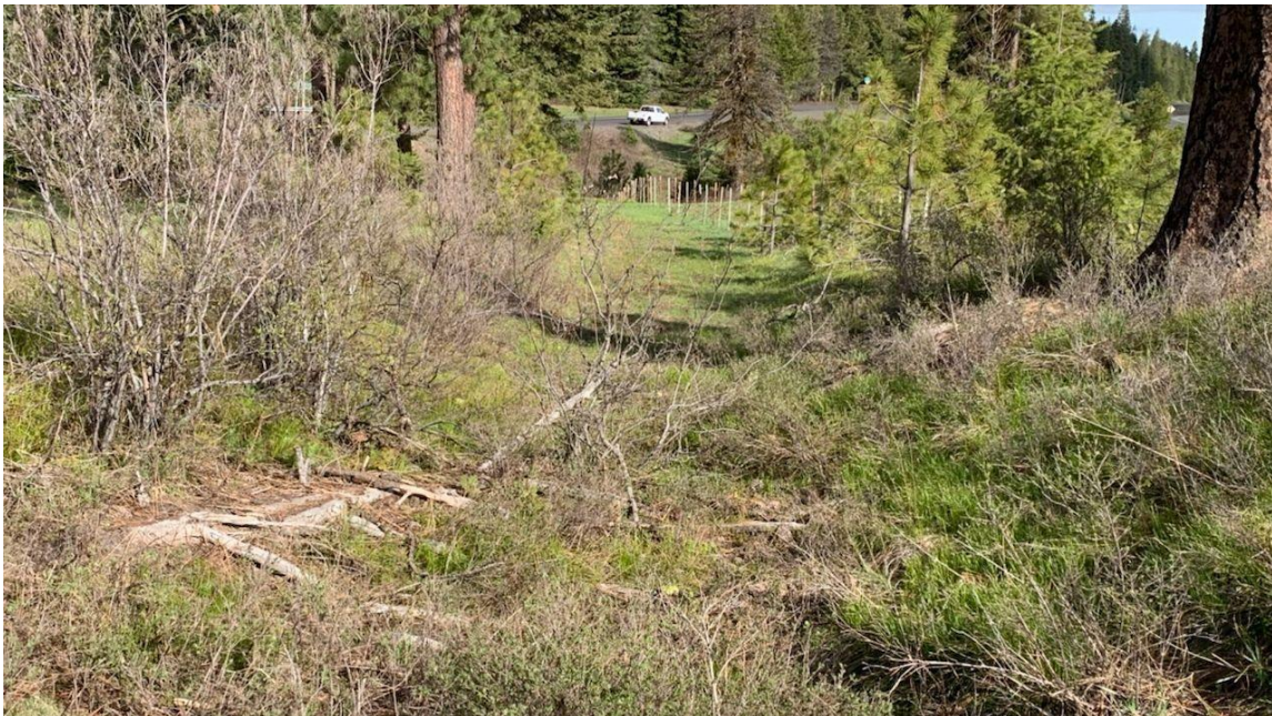
Trail ruts along Highway 30.

Next, we proceeded back along Highway 30 to the junction with Westminster Lane, where Mark showed us some trail ruts he had found between the highway and the freeway.