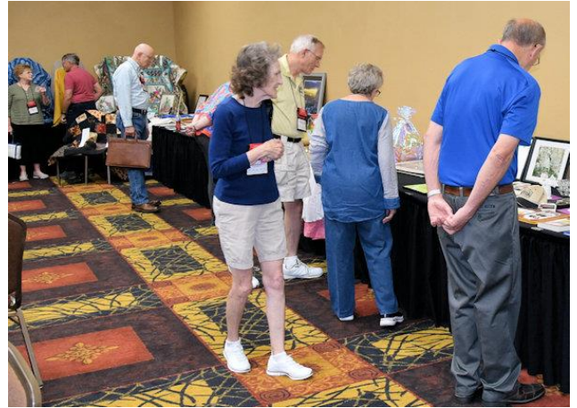
Attendees looking at raffle and silent auction items.