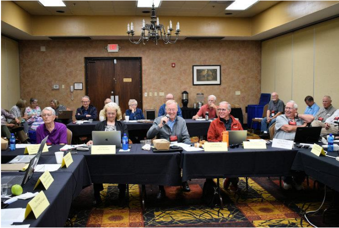
OCTA board meeting opened the convention on Sunday.