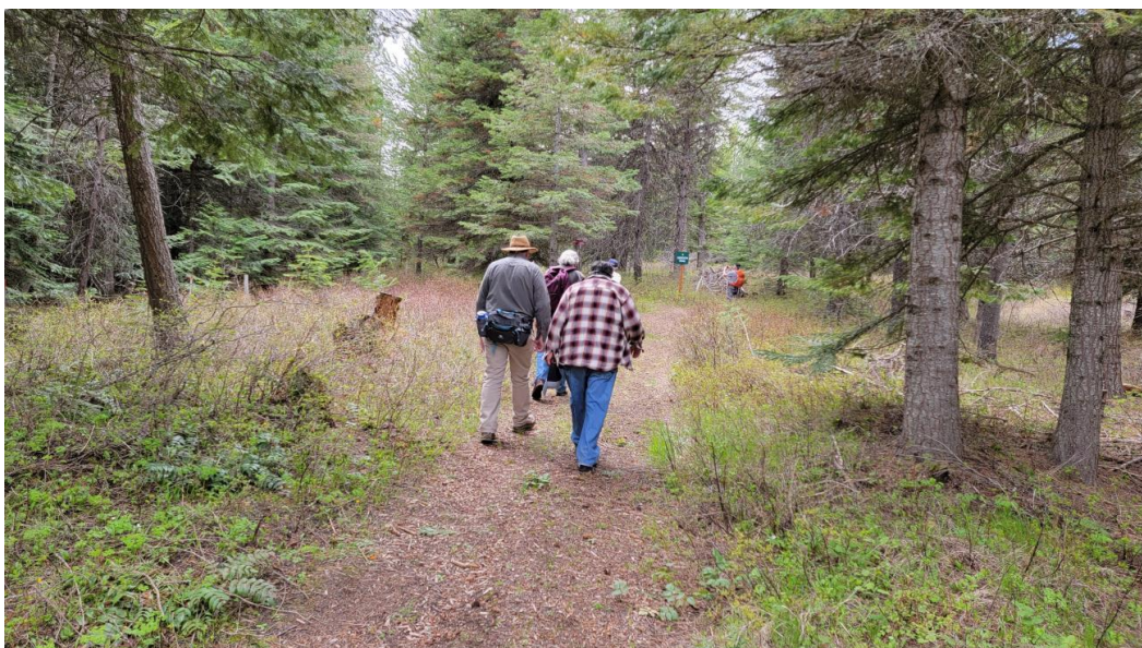
Approaching Westminster Woods Church Camp on the Toll Road.