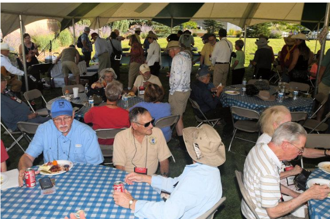
BBQ dinner under a tent at historic Fort Caspar on Wednesday evening.