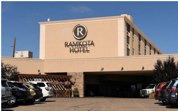
Ramkota Hotel, the convention hotel.

Two hundred OCTA members attended the annual convention, August 28 to September 1, 2022, at Casper, Wyoming. The convention week included activities at the Ramkota Hotel, the nearby National Historic Trails Interpretive Center (NHTIC), historic Fort Caspar, and bus tours. The speakers were excellent, although many were disappointed that some speaker sessions were concurrent so that difficult choices had to be made. The thoroughly enjoyable period clothing parade, awards banquet, and live auction closed the convention.