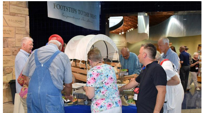
Welcome reception at NHTIC, Sunday evening.