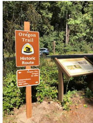
Installed sign at the Tollgate site.