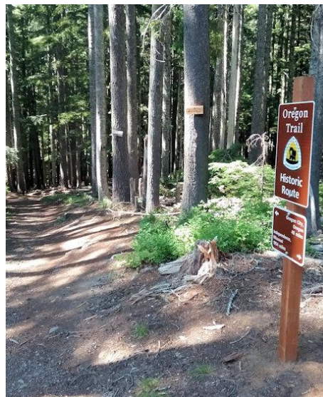
Installed sign at Barlow Pass.