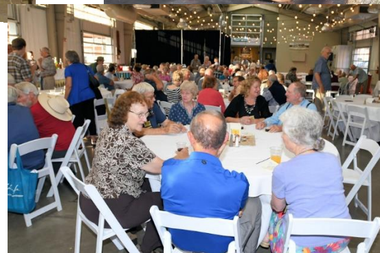
Farmer's Market venue.