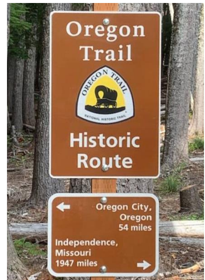
Sign at Barlow Pass.