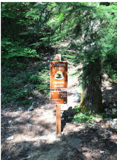
Installed sign at Laurel Hill.