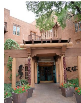
Hotel Santa Fe.

All and all, it was thoroughly enjoyable convention with a variety of extraordinary meals, activities, and speakers in a spectacular southwestern setting.