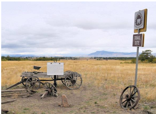
Meeker monument site.