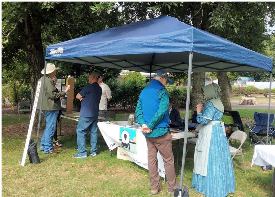
NW OCTA table and display.