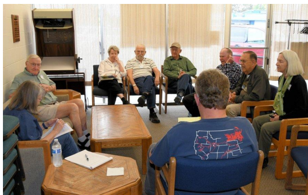
NW Chapter board meeting.