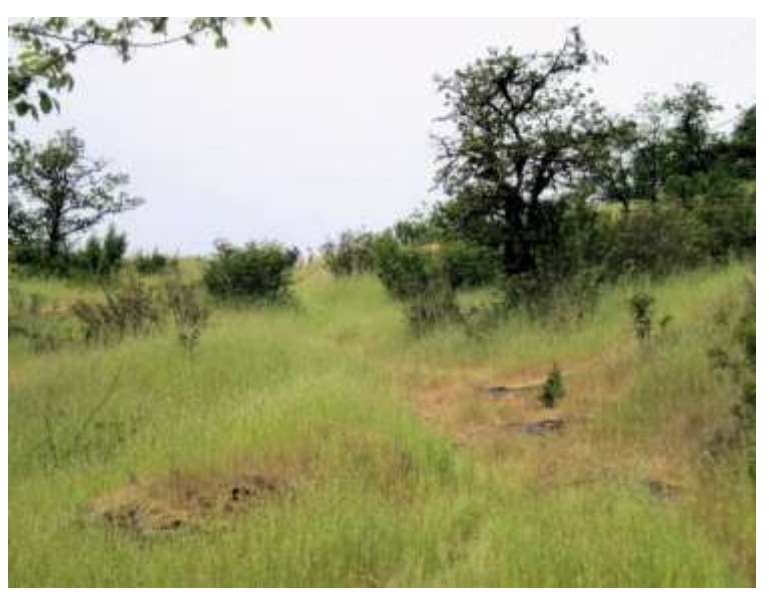
Myrtle Creek trail segment.

It was a wonderful two days out on the Applegate Trail. It seems we have a tendency to ignore the Applegate Trail because it is thought by many that there are no visible signs of passage, but there are many signs and we need to make sure we preserve and protect them where possible.