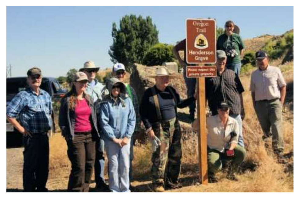
The group at Henderson grave.