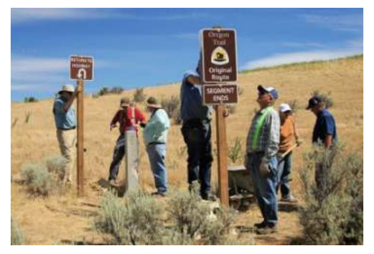
Installing signs at the end of the trail segment.