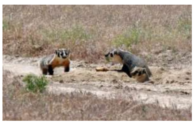
Badger guests for lunch on the trail.

Saturday June 20. It was almost the same crew with the exception of the two BLM ladies and Muriel. We went back out to Tub Springs and started there with the signage. We put up signs at the protected swales at Tub Mountain (the sign says they are on the original route for the Oregon Trail and