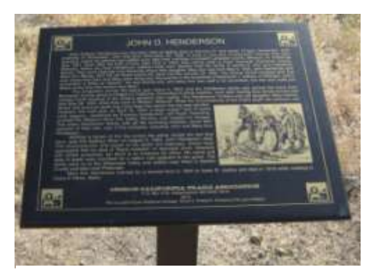
New marker at Henderson gravesite.

At the intersection of 5th Ave. East and Old Emigrant Road, or Old Oregon Trail Road depending on the map you use, we