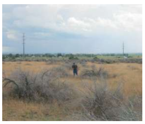
Looking southeast, Billy Simms in center.

On the following day, we joined up with several members of OHTAC to look at ruts at Emigrant Springs State Park. The park ranger took us to a couple of different areas in the park where we observed several sections of Class I ruts leading from the main trail (which is up on the ridge to the west) down to the springs and back up again to the ridge.