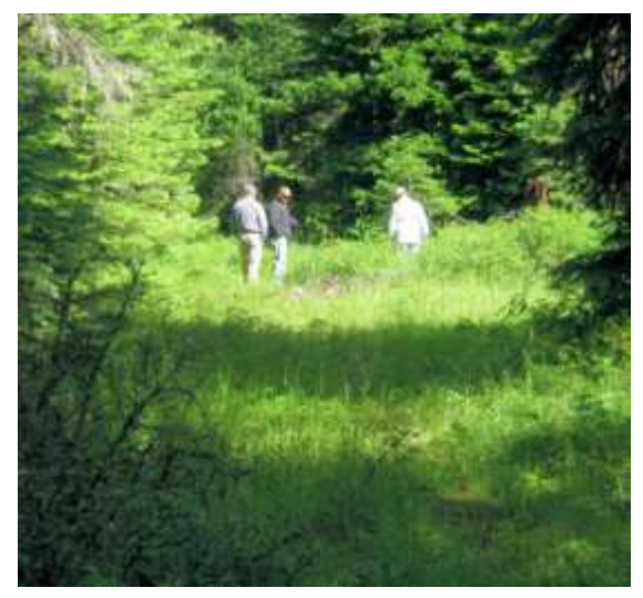
Possible Oregon Trail in Emigrant Springs State Park.