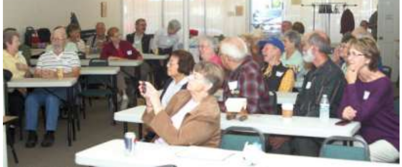
Attention is focused during the business meeting.