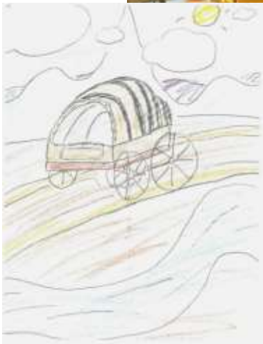
Sophie Hagan sent this picture along with a thank-you note.