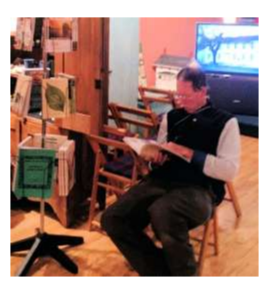
Tuck at Aurora.

The conversational banter was lively and good hearted. But poor Shirley was kept guessing all day about whether Rich and Jim's banter was facetious, or was it serious?