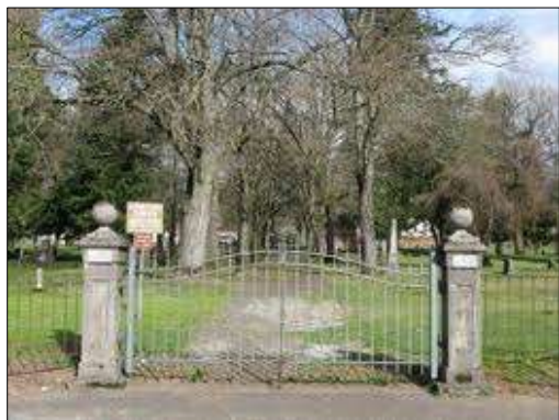
Old City Cemetery. Vancouver

About a two-block walk away is Vancouver's Old City Cemetery where many early pioneers, a number of whom came across the Oregon Trail, are buried, including Esther Short (called the "Mother" of Vancouver; she was Vic Bolon's great grandmother). The Genealogical Society has a walking tour with a nice map brochure, so I am proposing that if the weather is nice all who want to can take the walking tour of the cemetery.