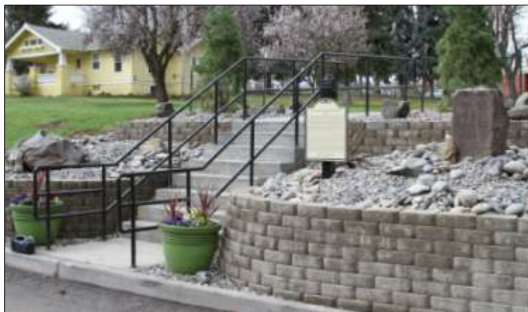
New location at Olney Cemetery, with interpretive marker.