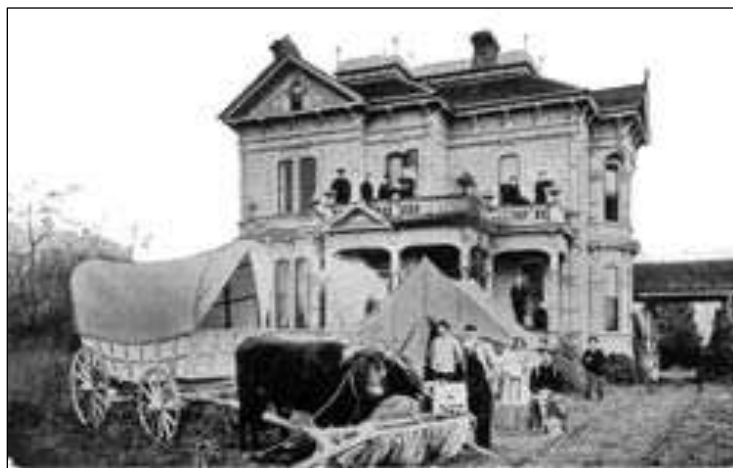
Oregon Trail Monument Expedition.

And though he left the buckskin outfit behind, it had sparked an idea. Meeker had learned that the public had definite expectations of what “an old pioneer” should look like, and so he began to hone a new image. Meeker the Businessman became Meeker the Old Pioneer, dressing more scruffily, letting his hair and beard grow longer and wilder, and so on. And for the rest of his life, Ezra Meeker was in dress and in fact, the “Old Pioneer”—a persona born here in Pendleton in 1906.