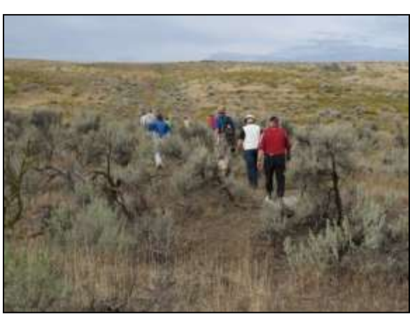
West of BLM kiosk at Four Mile Canyon.