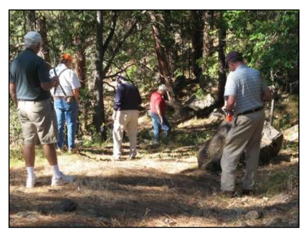
On ramp leading down to Rock Creek.