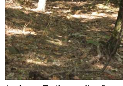
Mike Walker on trail south of ford. Applegate Trail ascending Sexton Mountain, just south of the pass.