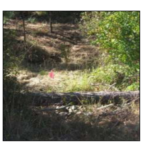
Harris Creek ford on Applegate Trail.