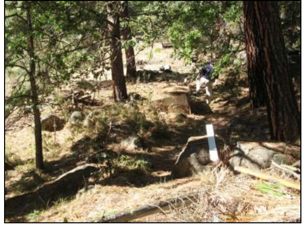
Another view of the ramp.