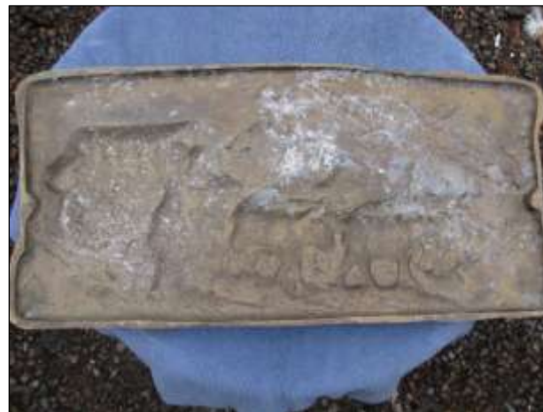
Back of the plaque