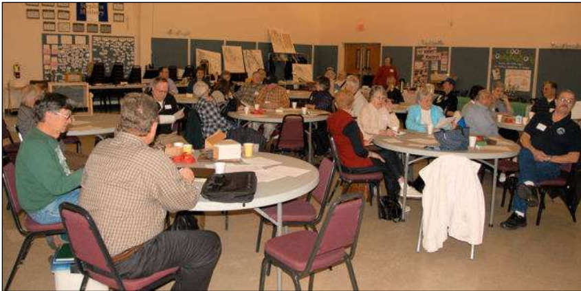
A view of the meeting room .