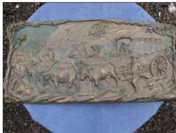
Front of the plaque