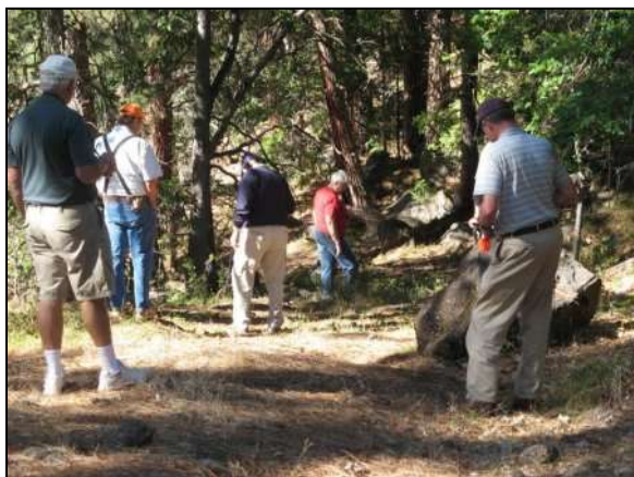
On ramp leading down to Rock Creek.