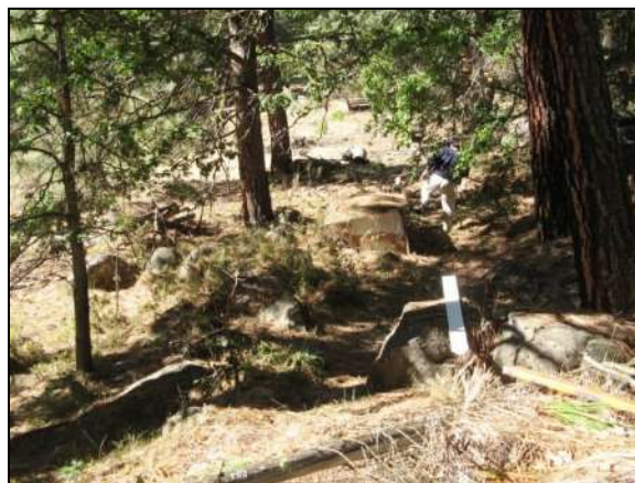
Another view of the ramp.