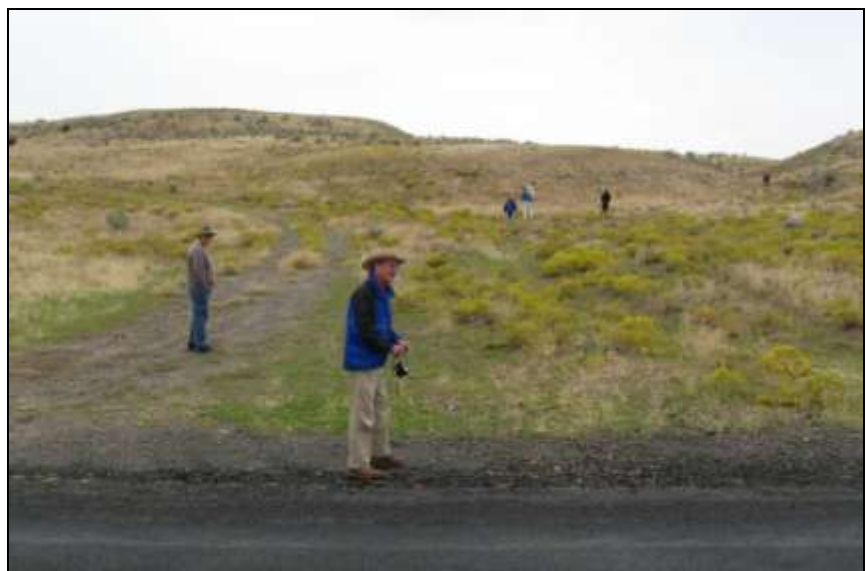
Ruts just west of Cedar Springs.