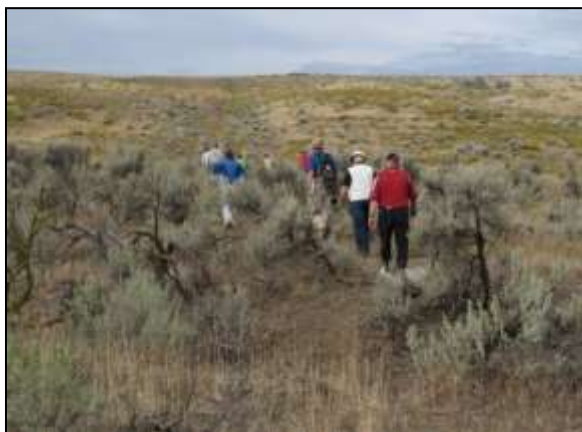
West of BLM kiosk at Four Mile Canyon.