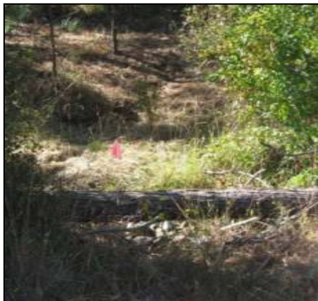
Harris Creek ford on Applegate Trail.