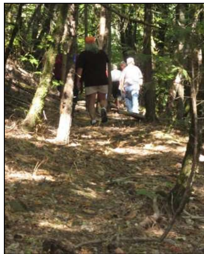
Applegate Trail ascending Sexton Mountain, just south of the pass.