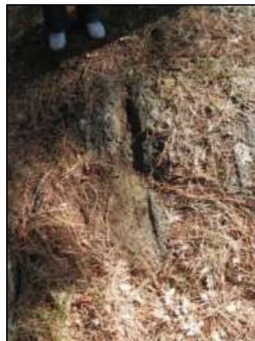
Wagon wheel groove in rock.