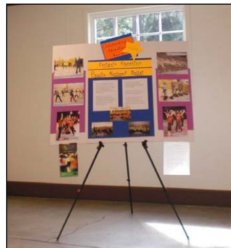
Display of the "Discover Dance" program at Eastgate Elementary School.