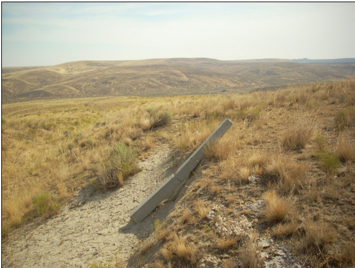
The soon-to-be former view looking back to the east from the crest of the hill in the BLM interpretive site.

The alternate north route will be crossed by at least two, maybe three, tower strings. Roads will be built.