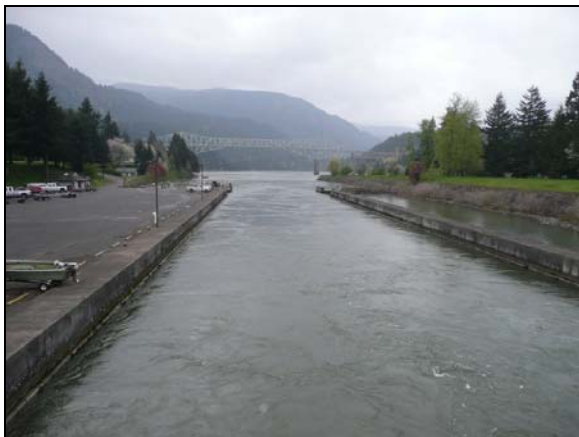
Cascade Locks.

After lunch in the local burger joint, we all traveled across the bridge to the Skamania County Museum, the Columbia Gorge Interpretive Center, a very well-developed museum that provides Native American history, Gorge geology, post-emigration history, huge logging and fishing equipment, and a wonderful locomotive and some cars for train buffs to explore.