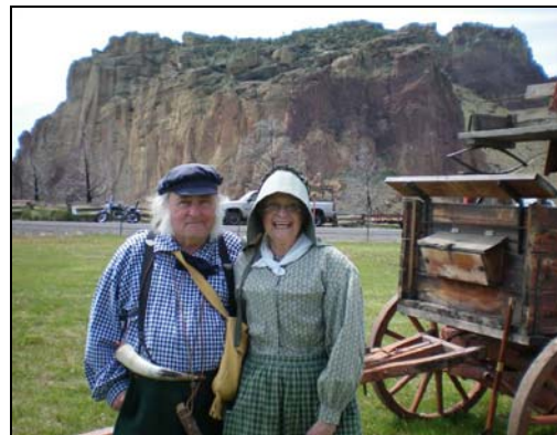
“Peter Skene Ogden” and “Hannah Perkins”