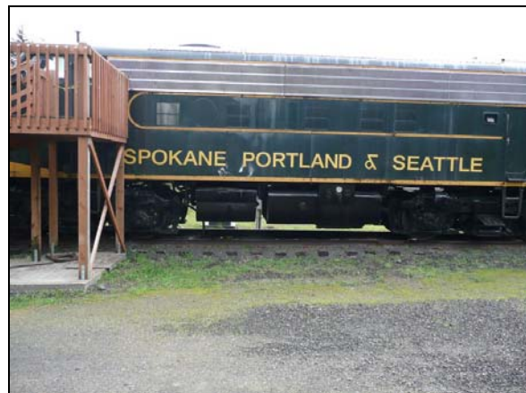
SP&S train cars.

The last activities of the day involved driving by the locations of the former Forts Lugenbeel and Raines, and walking tour of the site of the former Fort Cascades and Cascades townsite. Cascades was an early transfer point for traffic moving up and down the portage. The tour included traces of an old military road and the Cascade Portage Railroad. Everyone on the tour gathered beside the interpretive signage for some congenial discussion of chapter events, and a final picture of the day.