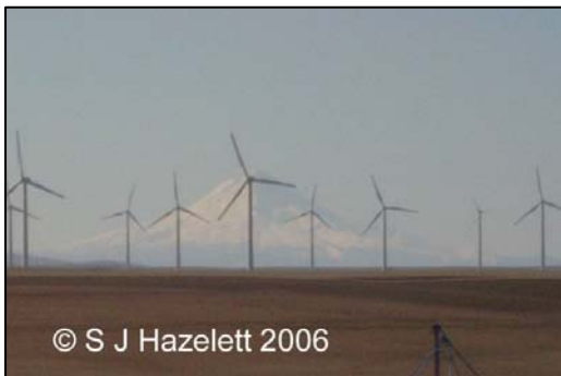
Wind turbines on the Barlow Trail.

After lunch Wendell Baskins will present a program about the Oregon Trail and the effects the development of wind power is having on it. The presentation is neither an attack nor defense of the wind development, but a look at what is going on from past to present, illustrated with slides and pictures.