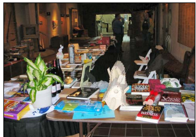
The raffle table was spread out in the Center's lobby.