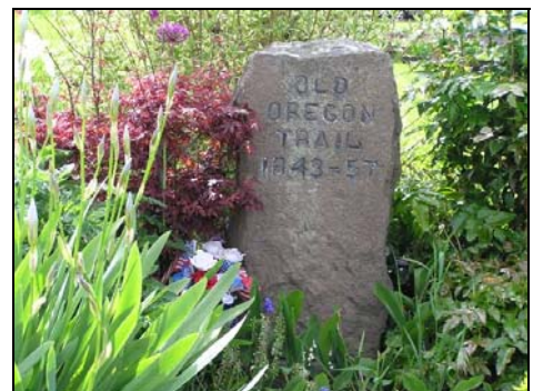
Meeker Monument, La Grande,

The NW OCTA Annual Picnic will be held September 9 in Centralia, Washington, at the Borst Park