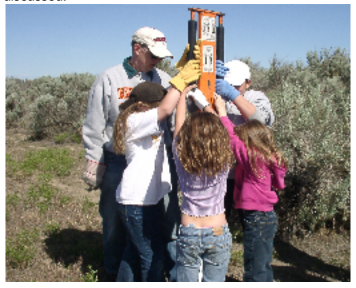
Group Effort

Both classes had a great time and seemed to enjoy themselves a great deal. The adult chaperones also had a chance to pound in the markers and many remarked that this was a great hands-on field trip. After the marking was over, a bit of trail history was discussed.