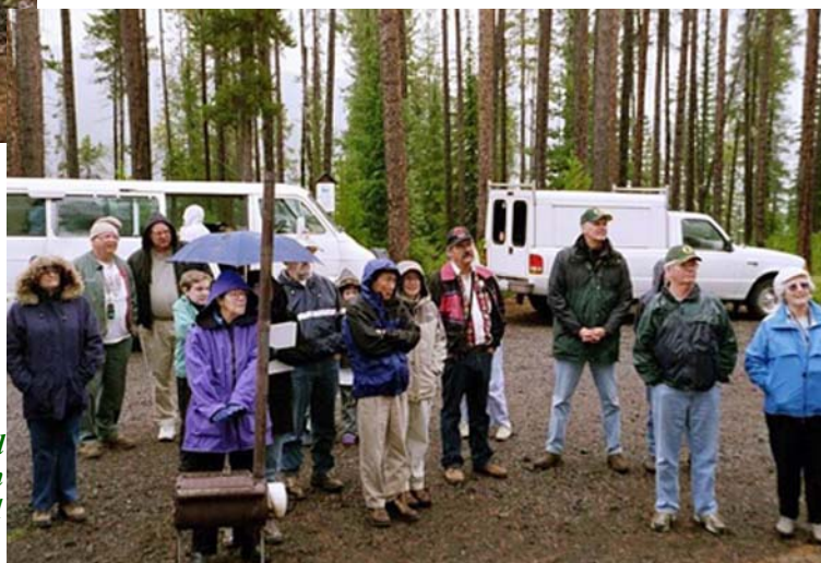
Free Emigrant Road marker dedication October 11