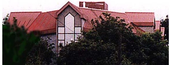
Annual Meeting site March 13, 2004 Museum of the Oregon Territory

It's that time of year again. The Annual Meeting is scheduled for Saturday March 13 in Oregon City at the Museum of the Oregon Territory, same place as last year. The museum is located overlooking Willamette Falls at Highway 99E and South Second in Oregon City.