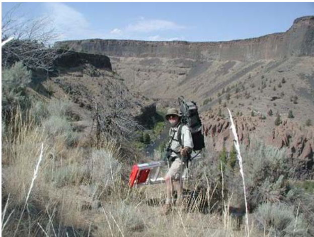
Speaker Jim Henderson returning from photographing Oregon's largest pictograph site along the Crooked River.

If at all possible, plan on being there. See the article in the outings section of this newsletter and also look at the list of trail monitors on page two. Picture your name in one of the empty slots.