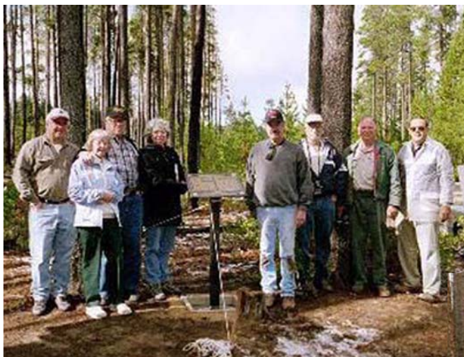
Free Emigrant Road marker placement October 10