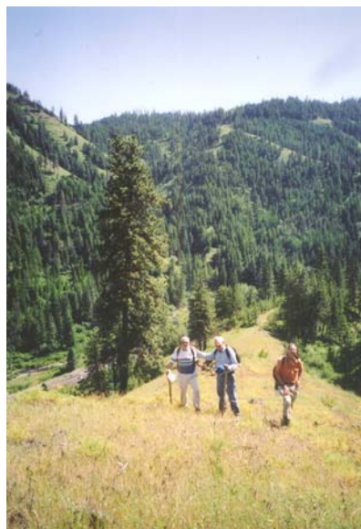
Short Canyon Ridge after crossing Meacham Creek.

On the trail we enjoyed the flowers and trees that Narcissa's journal says were reminiscent of her native Steuben Co., NY. Balsam root "sunflowers" were the most showy and characteristic flower. Both Jerrys from Hermiston kept us all relaxed with cheerful banter and oral ribbing of each other. During recent decades, the trail along the bottom of East Meacham Creek has become obstructed by overgrown brush.