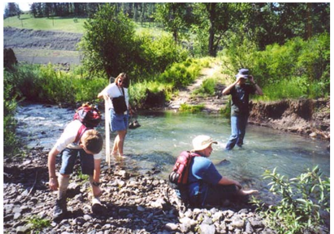
The joy of fording a stream.

The final leg, down the steep hill to Hilgard, left each of us wondering how the wagons survived. The joy we felt in reaching the Grande Ronde river could only have been exceeded by that of the emigrants stopping for camp.