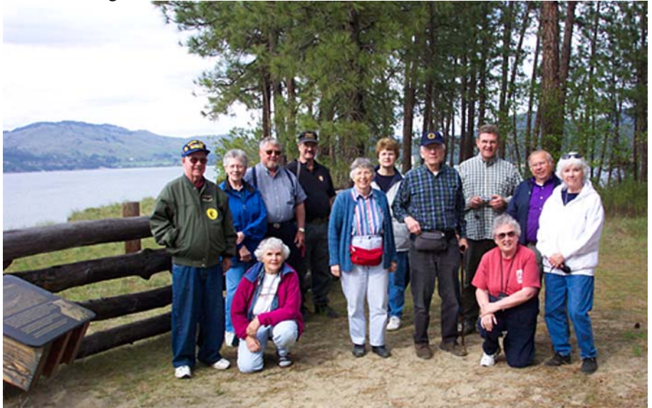
Spokane Trek participants at site of St Paul's Mission overlooking Kettle Falls.

We continued southward into the Spokane Indian Reservation to the confluence of the Spokane and Columbia Rivers, where the US Army built Fort Spokane in 1880 to replace Fort Colville. In 1899 the post was decommissioned and became headquarters of the Colville Indian Agency and a boarding school was established to teach European ways to Indian