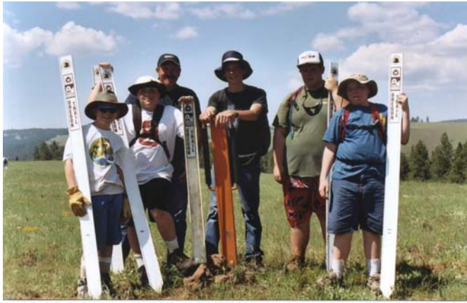
Five LaGrande area Boy Scouts and scoutmaster.

surrounding country. The Scouts and several others carried 35 posts and 30-pound driver across the nearly 6-mile section. After driving a post into the rocky ground each hiker wrote their name on the post to commemorate their contribution to Oregon Trail preservation.