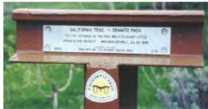
Old rail with new paint and plate

Since most if not all of the trail has been marked and identified within Oregon, the task becomes where to place steel markers and how the aluminum plates should be engraved.