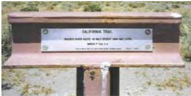
40 Mile Desert, placed 1992

The task now shifts from “seek and mark” to one of maintenance of the previously planted carsonites. Over the years, vandals, hunters, elk, range cattle, and weather have all taken their toll. The life span of our carsonite markers seems to be about five years, maybe ten at the most.