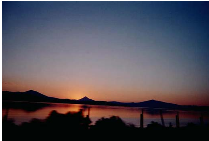
Mt. McLoughlin above Upper Klamath Lake