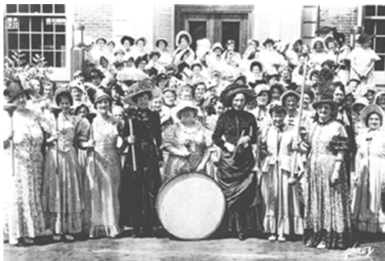
Beat the drum for computers. E-mail the newsletter and buy the CD.