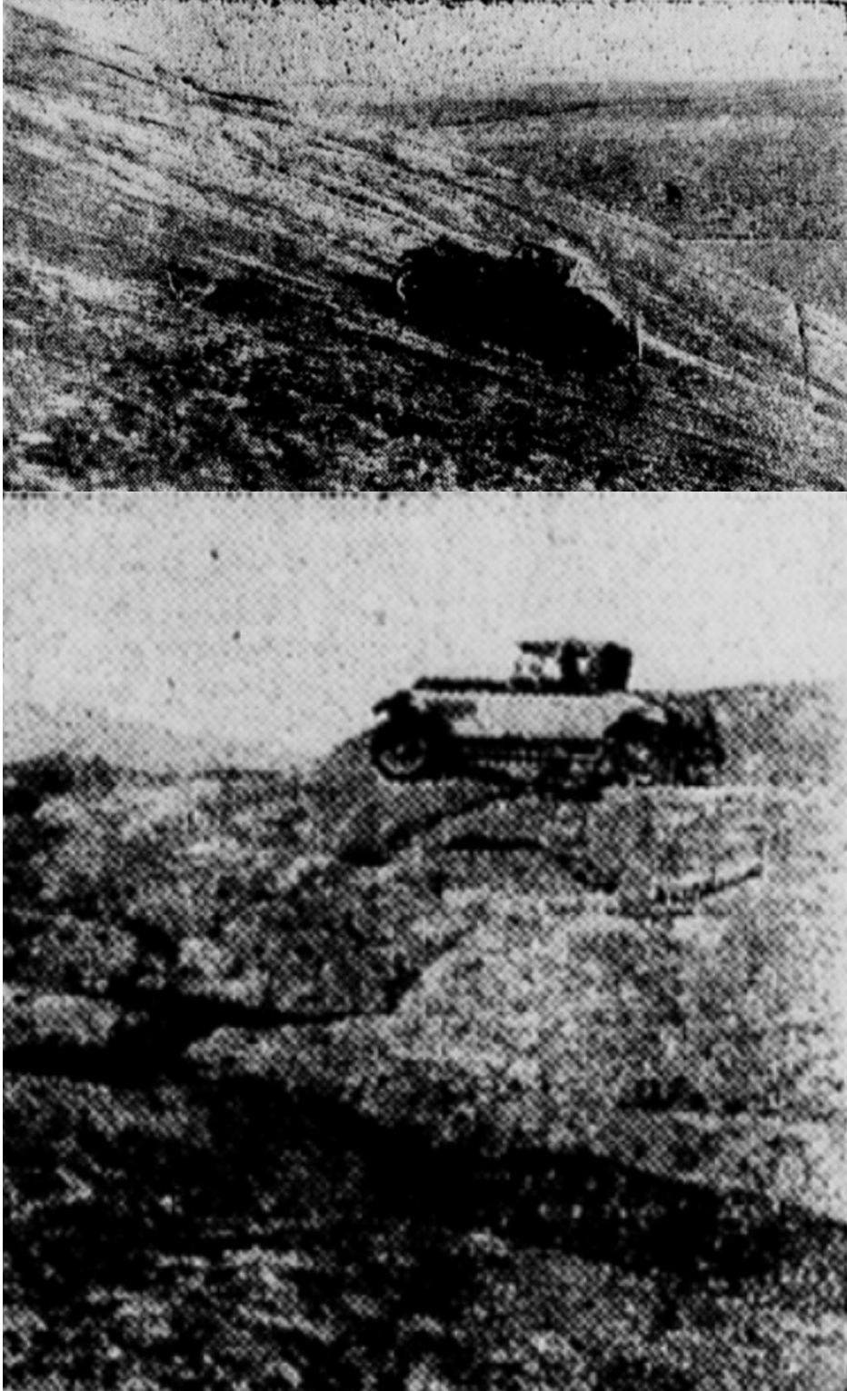
Automobile performance reached high perfection in the feat illustrated above. Picture above shows Whippet scaling steep slope of Independence Rock. Below—Car perched on top after precarious [sic] ascent. Casper Tribune-Herald, October 7, 1928, Section 2, p 1, col 6–7.