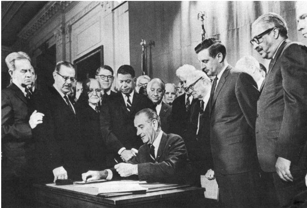
President Lyndon Johnson signs the National Trails Act on October 2, 1968.