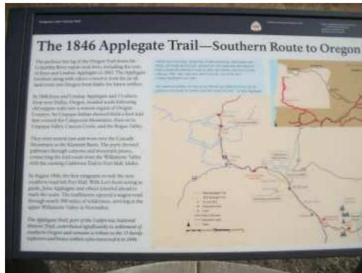
Center Applegate Trail sign at Emigrant Lake.